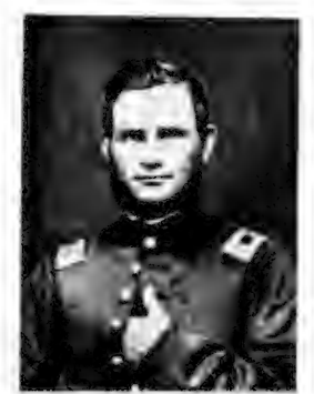
SIRST LIEFT, PARIES A. BOULES THE U